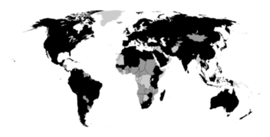
Figure 1. Countries classified by attractiveness to tourists

Note: Black indicates Countries attractive to tourists , dark grey indicates Countries unattractive to tourists and light grey indicates countries not in the estimation sample.